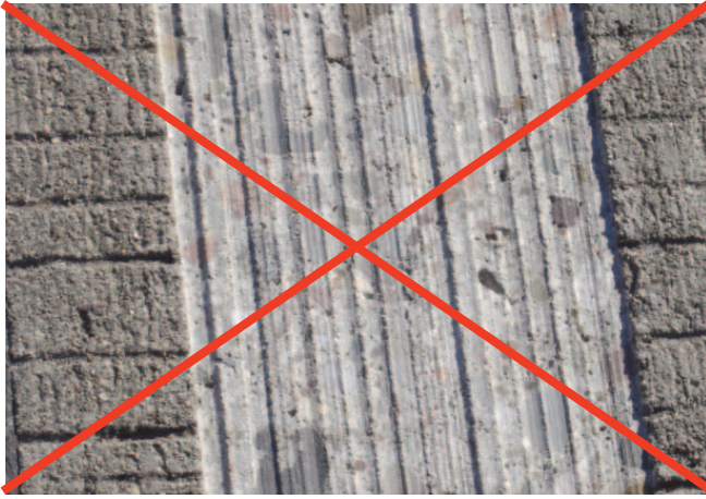
Groove with high ridges. This is the result of wide spacers used between the blades. Ridges should not exceed 20% groove depth.