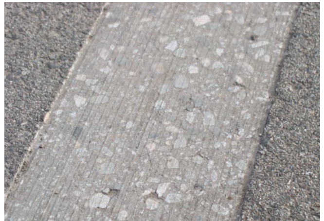
Consistent groove achieved with Diamond Blade saw

(KR16)