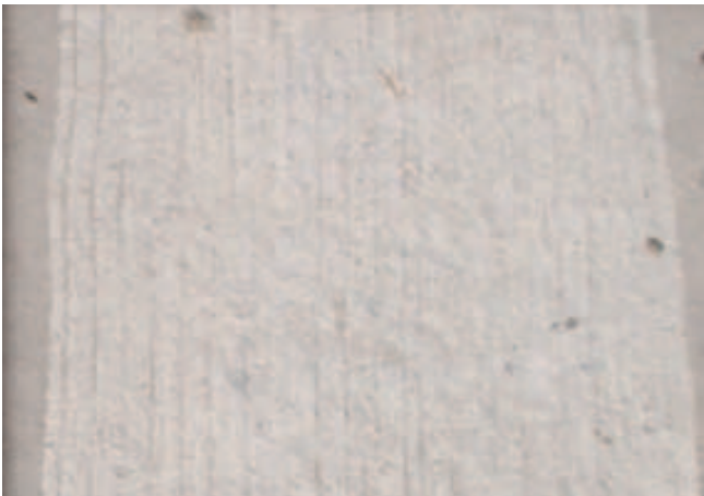
Consistent groove. Achieved with full face carbide cutters.