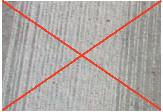
Inconsistencies in the cut. This is the result of using standard and not full face star cutters.