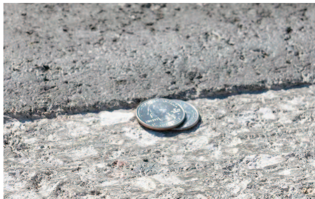
Represents 120 mils groove depth.

(KR16 Photo Courtesy of Kut-Rite Mfg. Co. www.kutritemfg.com)